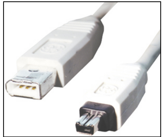
Figure 1. 6 pin and 4 pin Firewire Cable

For more information on video editing, go to http://www.aboutvideoediting.com/