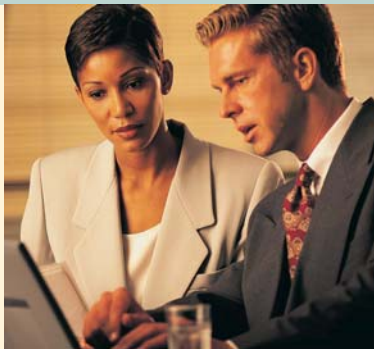
Chart a promising future in the financial services industry with a Graduate Certificate in Investment Analysis or Portfolio Management from New Jersey City University.

For more information on CFA Institute or its programs, go to www.cfainstitute.com